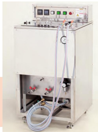
● Connected with hoses