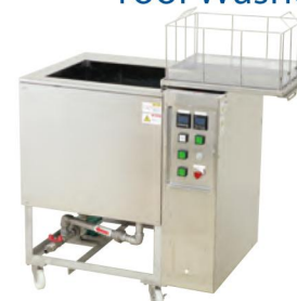
Supersonic Wave Mold Washer TW600M