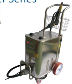
Steam Washer TW-S1